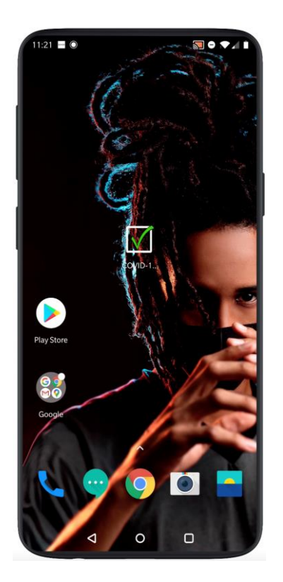
Chrome will add it to your home screen