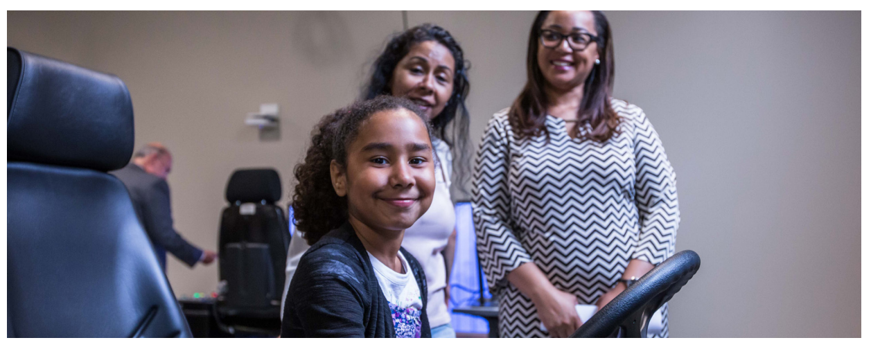
Community members had the opportunity to sample the new labs now open at the HCC Eastside campus.

Central Campus – Culinary Arts Program North Forest remains partially (Automotive) in the permit process.