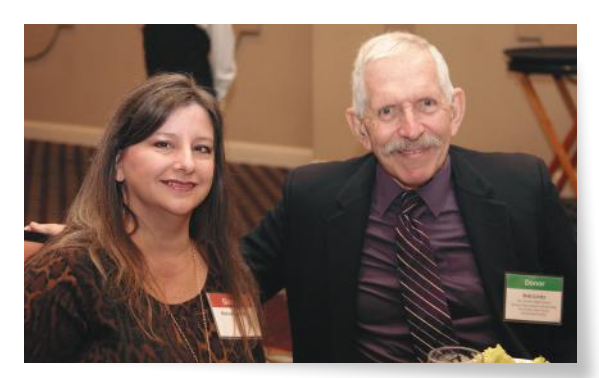
Attendees at the 2015 Scholarship Luncheon